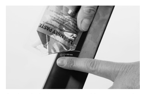
Apply a little Canyon assembly paste on the bottom part of the seat post and inside the seat tube.

Some Canyon models (e.g. Speedmax CF and Speedmax AL) have an oval shaped seat post. Mounting anything than the standard seat post is therefore impossible. Release both Allen bolts at the seat post clamp.