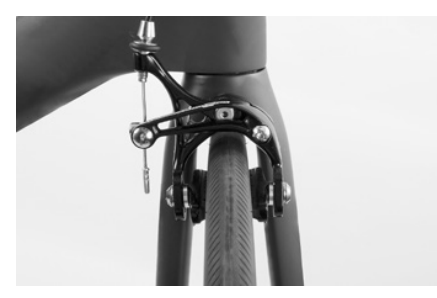
Verify that the brake is accurately centred with regard to the rim.

You can find further information in chapter "The brake system" in your bicycle manual Road bike on the enclosed CD.