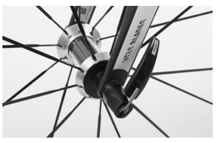
Check whether the front wheel is properly seated in the drop-outs and whether it runs accurately in the centre between the fork arms.

After the wheel mounting do a brake test when stationary. Actuating the brake lever should generate a clear-cut braking response before the lever touches the handlebars.