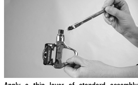
Apply a thin layer of standard assembly grease on the pedal threads before screwing in the pedals.