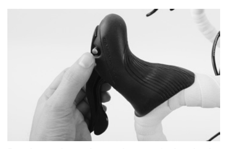
Re-close the release lever of the brake (Shimano, SRAM) immediately or move the bolt at the shift/brake lever back to its original position (Campagnolo) with the brake lever slightly activated.

You can find further information in chapter "The brake system" in your bicycle manual Road bike on the enclosed CD.