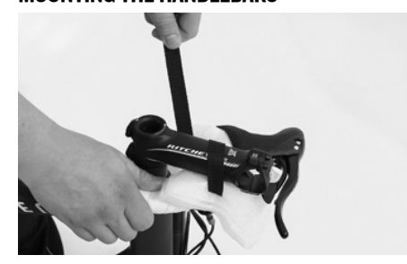
Keep hold of the handlebars and undo the band with Velcro fastener in the top at the stem fixing the handlebars.