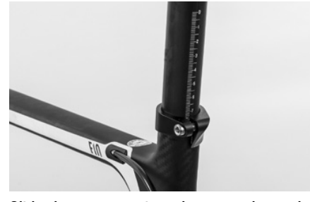
Slide the seat post into the seat tube to the desired saddle height.

Remove the protective cap from the top end of the seat tube. Release the seat post binder bolt at the seat tube. Read beforehand chapter "Adjusting the Canyon road bike to the rider" in your bicycle manual Road bike and on the enclosed CD.