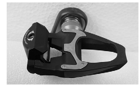
Canyon road bikes can be fitted with standard race pedals of the major brands.