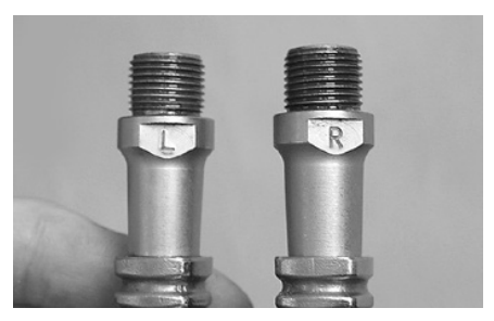
Before mounting the pedals, check the marking on the pedal axles first. "R" stands for right pedal and "L" for left pedal. Note that the left pedal has a left-handed thread that has to be tightened contrary to the direction you are accustomed to, i.e. anticlockwise.

Your seat post must go into the frame as a minimum to as far as underneath the top tube and up to the MAX marking of the seat post.