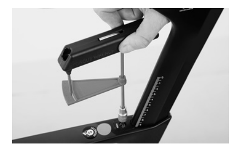
Tighten up the Allen bolt of the seat post clamp to the prescribed torque of 4 Nm up to a maximum of 6 Nm.

Your seat post must go into the frame as a minimum to as far as underneath the top tube and up to the MAX marking of the seat post.