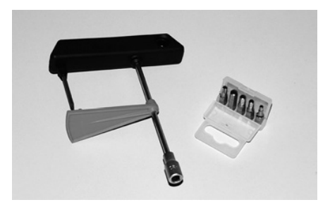
We regard the use of a torque wrench as essential so as to ensure the two parts can be fixed together securely and safely.