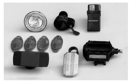
Fix the white reflector to the handlebars and the red reflector to the seat post, the spoke reflectors as well as a bell.