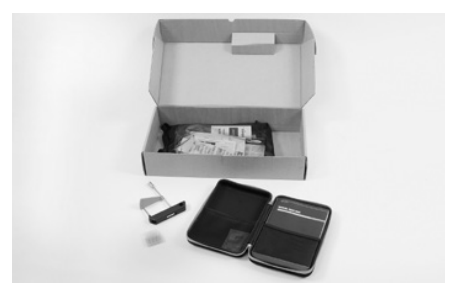
Remove the toolcase with the bicycle manual Road bike and the tools from the small parts box.

22 ASSEMBLY FROM THE BIKEGUARD ASSEMBLY FROM THE BIKEGUARD 23