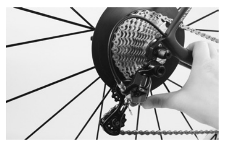
Shift through all gears and make sure the rear derailleur does not collide with the spokes when the chain runs on the largest sprocket.

You can find further information in chapter "The wheels - tyres, inner tubes and air pressure" in your bicycle manual Road bike on the enclosed CD.