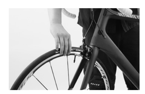
Spin both wheels to make sure they run true.

You can find further information on adjusting the gears in chapter "The gears" in your bicycle manual Road bike on the enclosed CD.