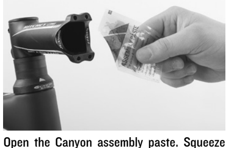
out some assembly paste and apply a thin laver of carbon assembly paste on the inner side of the faceplate as well as in the clamping area of the stem body.