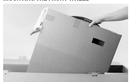
Remove the front wheel from the protective cardboard and from the wheel bag, if available.

Saddle and seat post are fixed to the front wheel with a band with Velcro fastener and protective film. Carefully undo the band and put the saddle and the seat post aside.